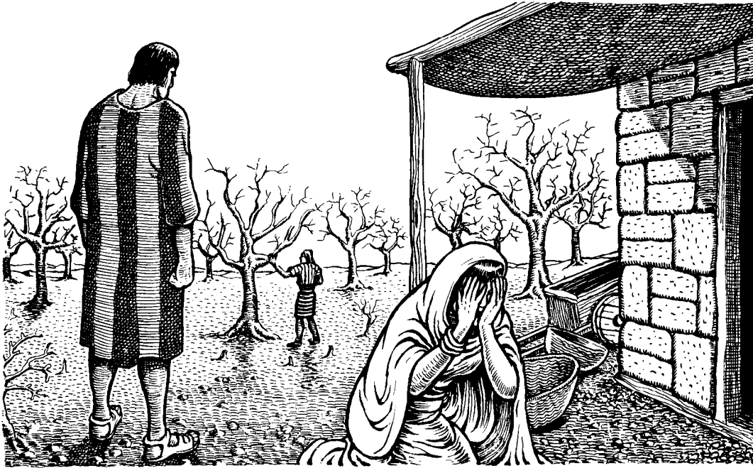
The Egyptians found that the locusts had eaten every green leaf and plant.