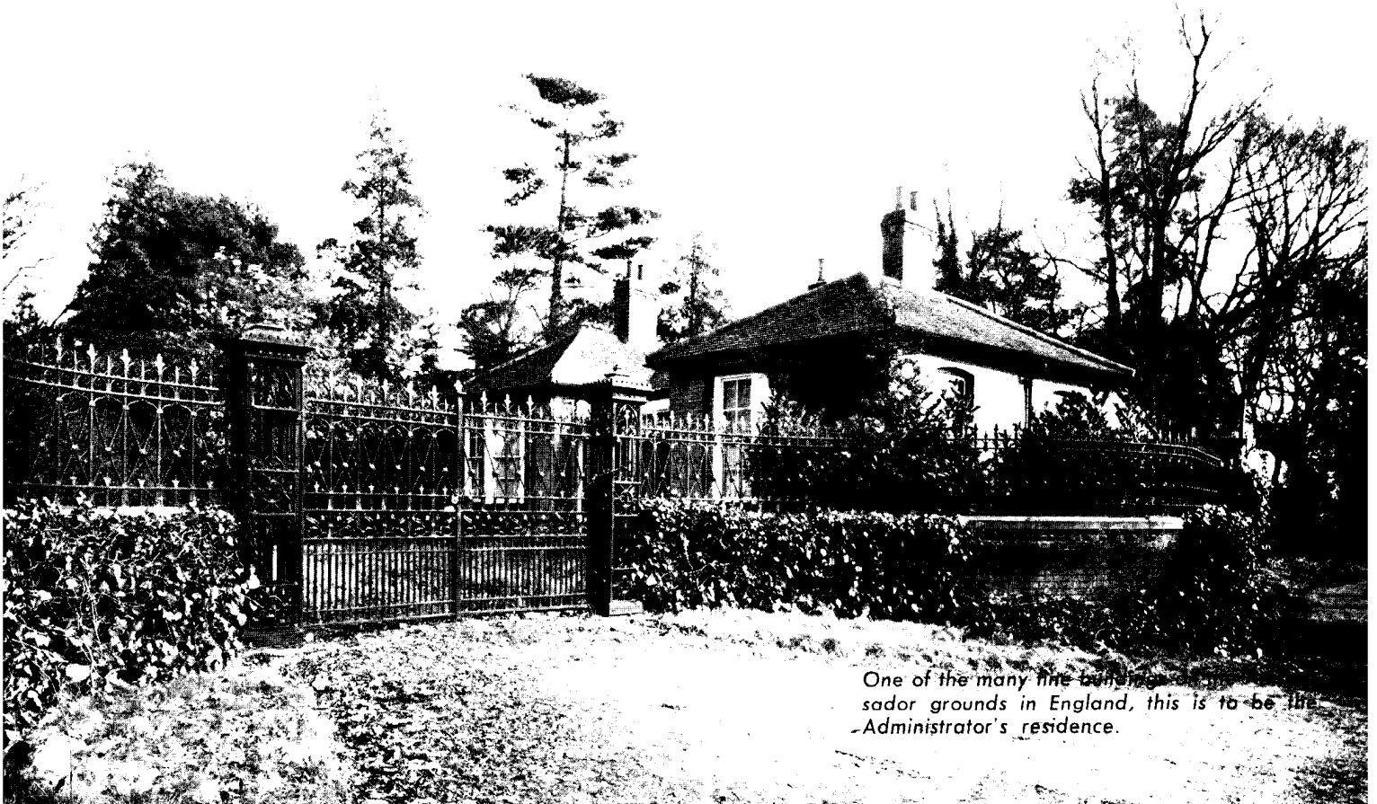
One of the many fine buildings on Ambassador grounds in England, this is to be the Administrator's residence.